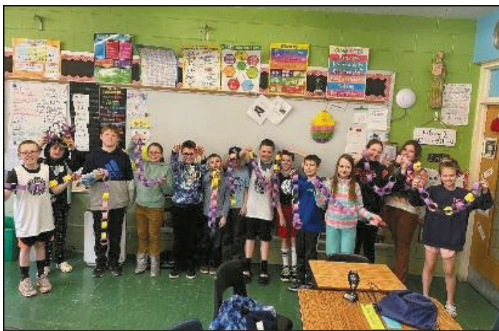
We are having fun in our 3rd & 4th Grade Religious Education Classes!